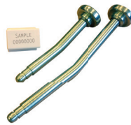
Mega Rail Bolt