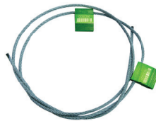
Mega Cable Lock