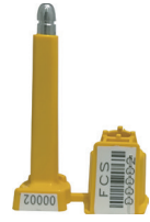
Fort Container Seal